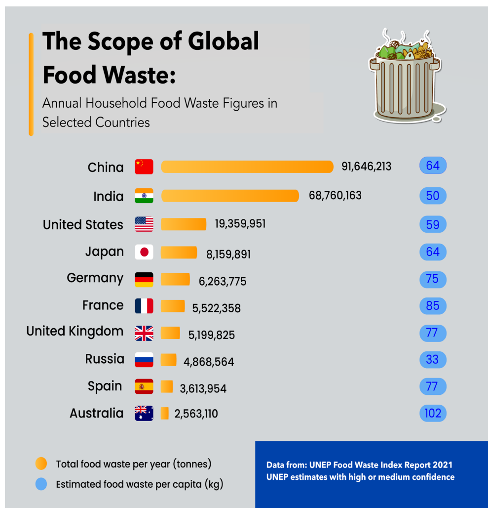
Figure 1. The Extent of Global Food Waste: Annual Household Food Waste Figures in Selected Countries. Data were obtained from [5].

Ultimately, the successful implementation of a circular economy for food waste will depend on continued commitment and collaboration from all actors involved in the food system, as well as ongoing innovation and adaptation in response to changing circumstances and emerging challenges [28]. Figure 1 provides an illustrative depiction of the scope of global food waste, showcasing annual household food waste figures from selected countries.