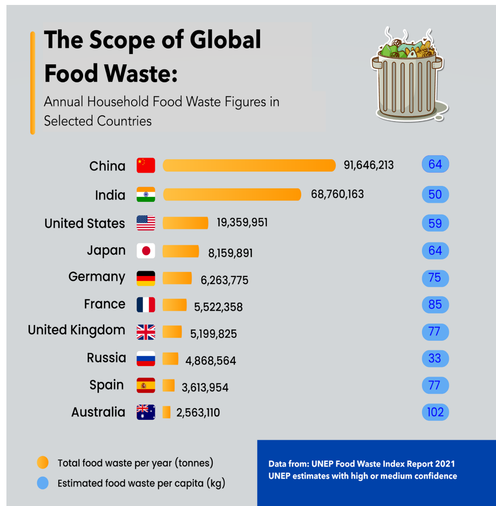
Figure 1. The Extent of Global Food Waste: Annual Household Food Waste Figures in Selected Countries. Data were obtained from [5].

Ultimately, the successful implementation of a circular economy for food waste will depend on continued commitment and collaboration from all actors involved in the food system, as well as ongoing innovation and adaptation in response to changing circumstances and emerging challenges [28]. Figure 1 provides an illustrative depiction of the scope of global food waste, showcasing annual household food waste figures from selected countries.