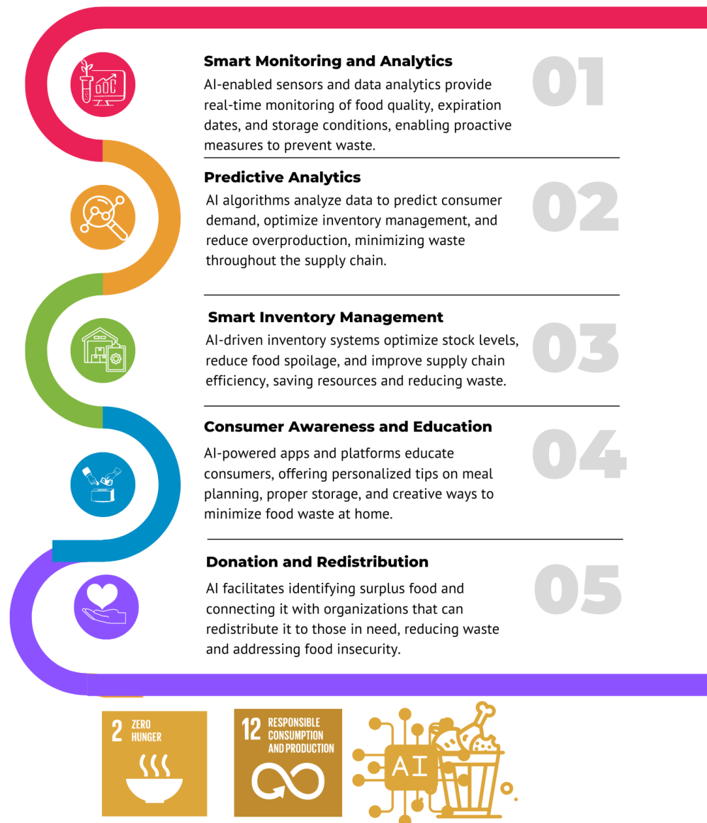
Figure 3. Different Applications of AI in Food Waste Management.