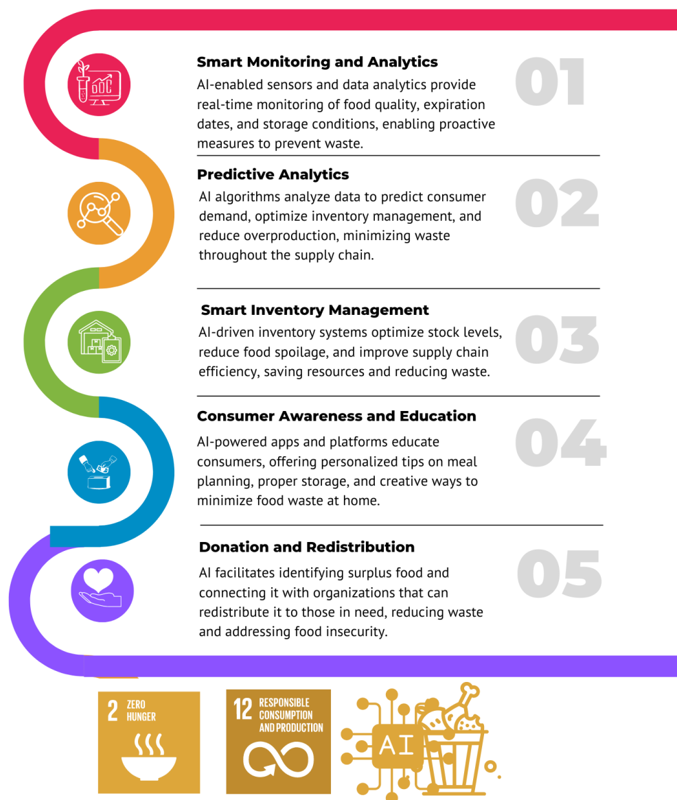
Figure 3. Different Applications of AI in Food Waste Management.