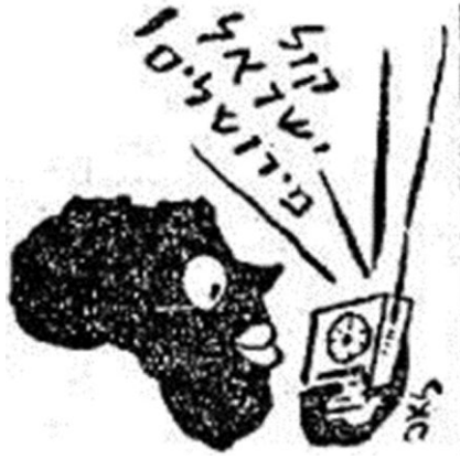
Figure 2. “Voice of Israel from Jerusalem!” (Davar, August 8, 1961), 25 × 23 mm.