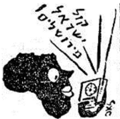
Figure 2. “Voice of Israel from Jerusalem!” (Davar, August 8, 1961), 25 × 23 mm.