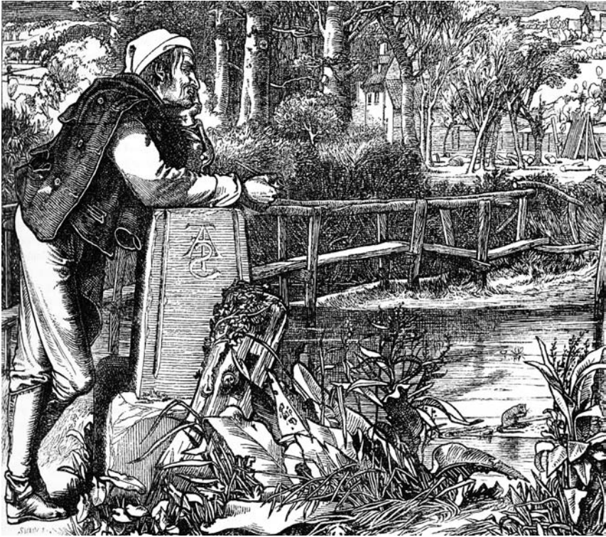
Figure 2: Frederick Sandys, illustration for “The Old Chartist,” Once a Week 6 (February 8, 1862): 183.