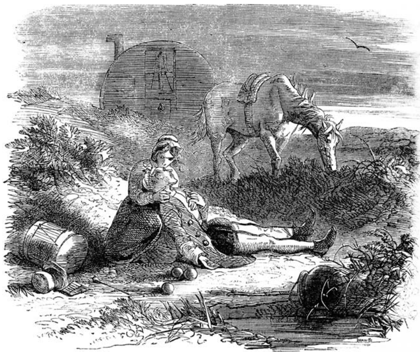
Figure 1: Phiz [Hablot K. Browne], illustration for “The Last Words of Juggling Jerry,” Once a Week 1 (September 3, 1859): 190.

he renders God in his own image—a juggler—rather than vice versa. Jerry’s death is figured as God’s own cheat wherein life on earth is “juggled away” from the living. 27 As for his wife, the poem tells us that she has lived long and hard, yet she appears remarkably young and pretty in the accompanying illustration. Further, the couple’s positioning in the illustration suggests mutual adoration and affection while the poem evinces an imbalance. The juggler attests to his wife’s value—“But it’s a woman, old girl, that makes me / Think more kindly of the race: / And it’s a woman, old girl, that shakes me / When the Great Juggler I must face”—and to her skill in the kitchen as well as her fidelity: “Nobly you’ve stuck to me, though in his kitchen / Duke might kneel to call you Cook: / Palaces you could have ruled and grown rich in, / But old Jerry you never forsook.” 28 Jerry’s trustworthiness is questionable, though, as he also boasts that the queen herself has blest his entertainment. While the dramatic monologue structure requires an implied audience and while the juggler’s wife could be understood as that audience, her steadfast presence in the image overwhelms the ambivalence that grounds much of the poem, where the precise nature of the audience is