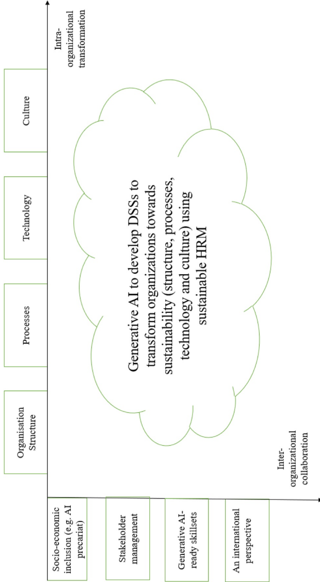
FIGURE 6 Research scope of generative AI to embed sustainability within organizations through sustainable HRM.