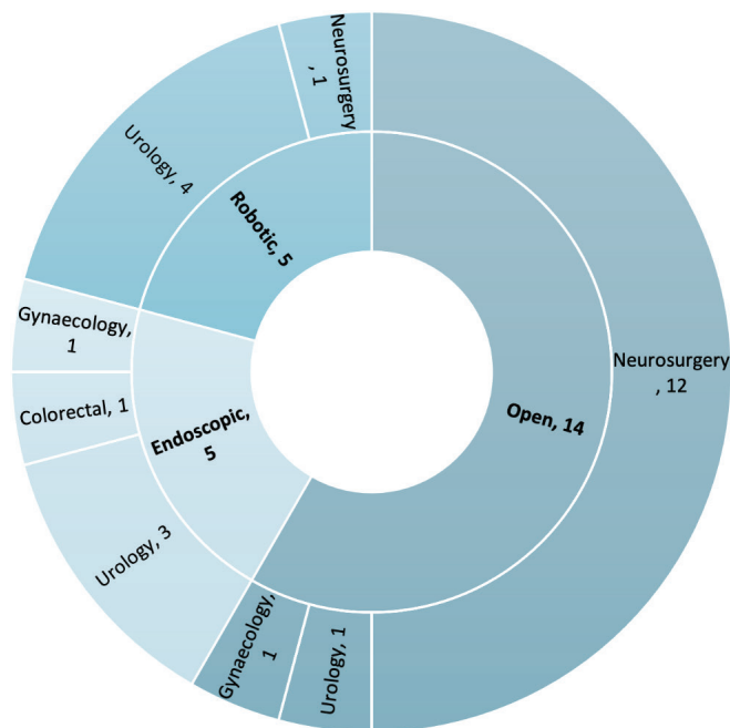
Most Prolific Publishers of VR Study by Specialty