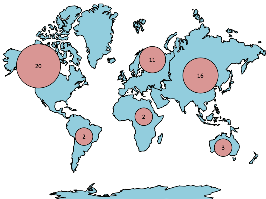
Figure 3. Number of VR studies related to oncology by continent and country.