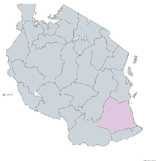
A map showing the country of Tanzania where cases of leptospirosis were identified in July 2022.

food demand, which has led to more unchecked urbanisation, agricultural, and wildlife intrusion [10]. Additionally, a disease outbreak could be delayed and contributed to by poor sanitation and clinicians ignoring disease suspicion [10].