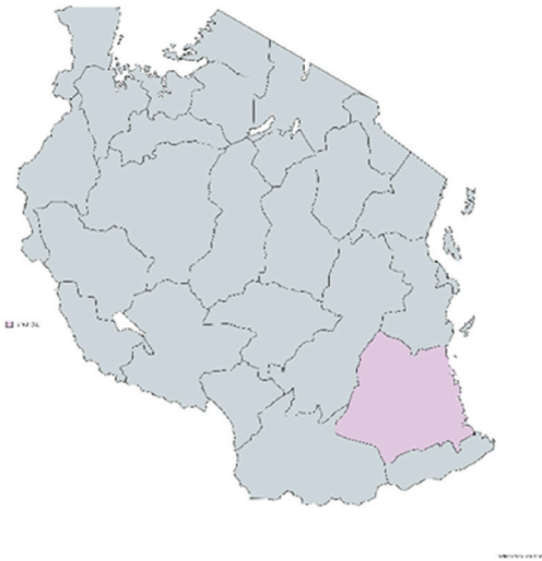
A map showing the country of Tanzania where cases of leptospirosis were identified in July 2022.

food demand, which has led to more unchecked urbanisation, agricultural, and wildlife intrusion [10]. Additionally, a disease outbreak could be delayed and contributed to by poor sanitation and clinicians ignoring disease suspicion [10].