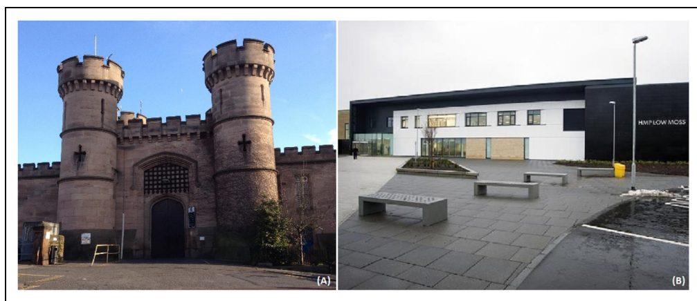
Figure 1. (A) The exterior of HMP Leicester, UK. Source: Author; (B) the exterior of HMP Low Moss, UK. Source: MarkyMarky123 (Own work) [CC BY 4.0 ( https://creativecommons.org/licenses/by-sa/4.0/deed.en )], via Wikimedia Commons.

Prison architecture has long been associated with attempts to deliberately engineer or evoke affectual responses. In their earliest guises, prisons exhibited a threatening exterior, where unassailable walls, towers and parapets were often decorated by gargoyles or figures pictured behind bars (see Figure 1(A)). This meant that although the bricks screened what was taking place within, the public could still be reminded of the sombre nature of the building and the detrimental aspects of committing crimes – a key component of what was presented as a crime-deterrence strategy (Pratt, 2002: 37).