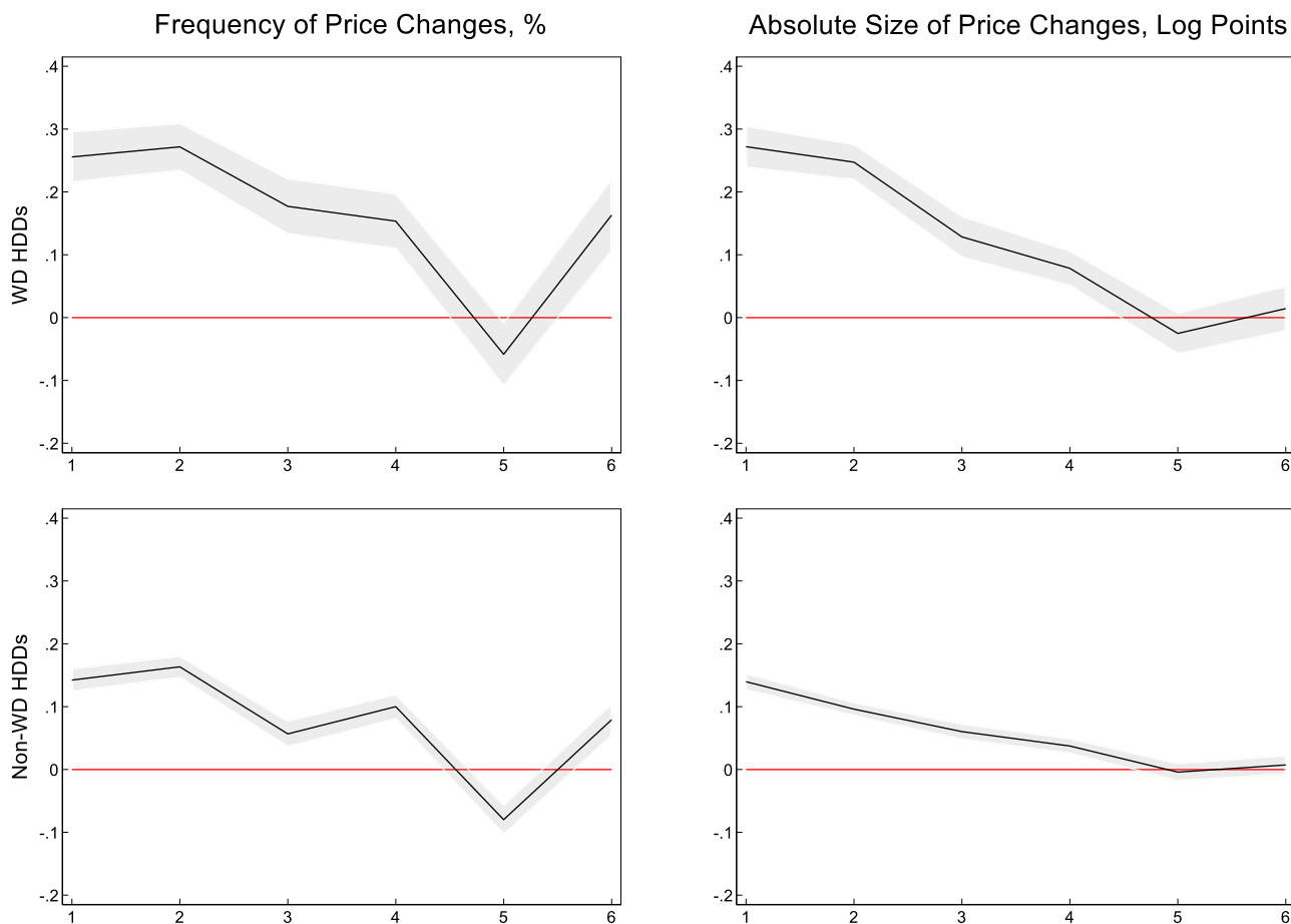
FIGURE 3 WD and non-WD HDDs price-setting response to the flood. This figure presents the impact of the shock on the price-setting behaviors of sellers during the period 6 months after the flood by showing the coefficients and the 95% confidence interval of 6 months-dummy variables (for the full table of coefficients, please see Appendix Table A3.2) for WD (top panels) and non-WD (bottom panels) products. The left panels report results for the frequency of price changes, while the right panels show estimates for the absolute size of price changes. In all cases, the vertical axis on the left is the size of the coefficient relative to that of SSDs. The horizontal axis is the number of months after shock (from 1 to 6). The red horizontal line marks the difference being equal to zero.

The first row in Figure 3 suggests that sellers of WD HDDs began increasing the frequency and size of price increases in the first month following the shock. In that same month, the frequency and size of price changes of WD HDDs increased by more than 20%. That reaction might have been caused by the plummeting supply of hard drives, as