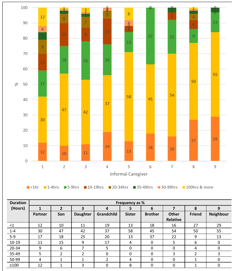
Figure 2. Stack bar chart of hours of informal care provided by caregiver for person with moderate to severe pain reported in the Wave 7 ELSA cohort.