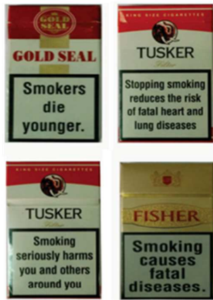
(a) Current Ghanaian warnings

1 2 3 4 5 6 7 8 9 10 11 12 13 14 15 16 17 18 19 20 21 22 23 24 25 26 27 28 29 30 31 32 33 34 35 36 37 38 39 40 41 42 43 44 45 46 47 48 49 50 51 52 53 54 55 56 57 58 59 60