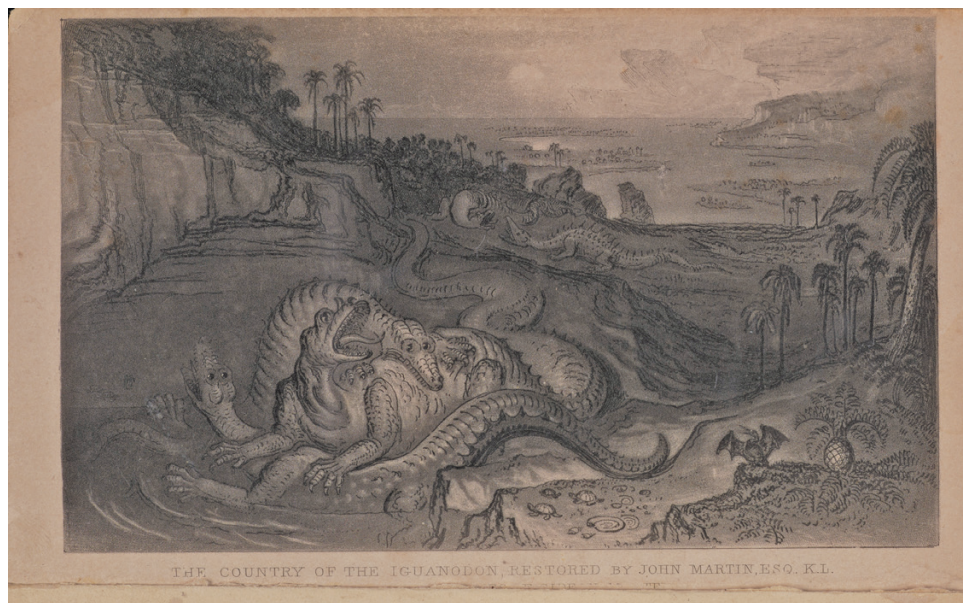
Figure 1. Mezzotint of John Martin's painting The Country of the Iguanodon . Frontispiece in Gideon Mantell, The Wonders of Geology; or, A Familiar Exposition of Geological Phenomena , 2 vols (London: Relfe and Fletcher, 1838). Printed Material MF.31.4–5.

same book, Mantell also transported readers back through time in bravura prose, 'imagining' the changes seen by 'some higher intelligence from another sphere' observing Earth at various geological ages, much as immortal wanderer Zanoni would later hover over the distant primordial planet. 4 Thus the simulated time-travelling of The Wonders of Geology proved stimulating source material for Bulwer-Lytton's romance. He, in turn, promptly sent the geologist a presentation copy of Zanoni , the praise in which was itself quoted to promote new editions of Mantell's book. 5