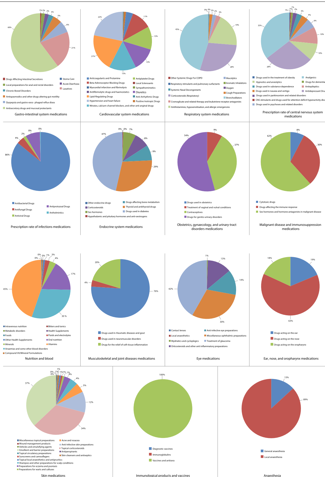
Fig. 2 Percentage of each medication prescription from the total number of medications in the same therapeutic class between 2004 and 2019