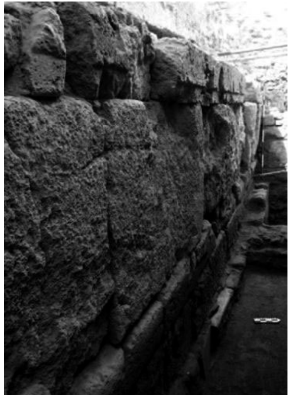
172. Athens: Early Byzantine fortifications (curtain wall).