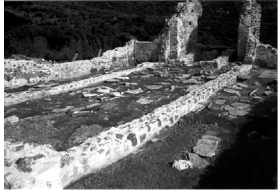
175. Palioklisi, near Photike: Early Byzantine basilica.

Extramural housing and cemeteries (situated outside the frequently reduced-defended areas of towns) are the subjects of several new reports. Extensive rescue excavations at Sparta by the 5 th EBA around Alkman Street have demonstrated that there was significant Early Byzantine habitation outside the city walls. Early Byzantine cemeteries, or phases of multi-period cemeteries, have also been identified there. The 5 th EBA's excavations show that a major ancient cemetery on the southwest side of the city was in use from Hellenistic times to the fifth century AD. South of ancient Corinth , on the slopes of Acrocorinth, two Early Byzantine cemeteries have been explored by the 25 th EBA, one of which is 90m southeast of the Quadratus Basilica ( Fig. 176 ). Remains of more than 1,000 skeletons were found in cist graves that were being re-used, and which are believed to form part of a larger cemetery. A 'Byzantine' cemetery of unspecified chronology has also been found just outside the eastern section of the Early Byzantine city wall. The 37 th EBA meanwhile reports 'Byzantine' graves in association with the ancient Long Walls linking Corinth and the Lechaion harbour . At Nafpaktos the 6 th EPCA reports three clusters of Early Byzantine graves around the historic town, two of which are recognized as belonging to cemeteries.