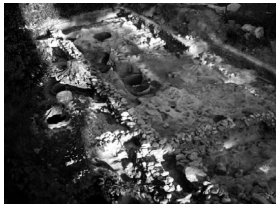
187. Athens, Kiphissia: Late Byzantine winery.

mortar-bonded undressed stone masonry ( Fig. 184 ). By the Anotati Scholi Kalon Technon, the 1 st EBA recorded a Middle to Late Byzantine wine-press. On Kiphissou Avenue the 1 st EBA recorded walls, silos and pithoi belonging to an extensive agricultural complex of ‘the Byzantine to Late Byzantine period’ ( Fig. 185 ). At Ano Glyphada the 26 th EPCA explored a complex of rooms of varying width but almost all ca. 3m long, arranged around all four sides of a 43m 2 yard and associated with Middle Byzantine pottery. There is evidence of an outer yard with a protected entrance and the foundations of a substantial structure 2 × 2.5m at its base (called a ‘tower’ but perhaps a kind of storeroom). On Pentelis Avenue part of a Late Byzantine to post-Byzantine storage complex was reported ( Fig. 186 ). In the district of Gerani an extensive agricultural storage complex of the 13 th –14 th century is also reported. Finally, at Drosia, Kiphissia , two wine-presses, pithoi and associated buildings of the ‘Byzantine’ era have been reported ( Fig. 187 ).