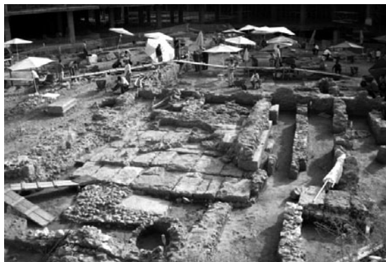
185. Athens, Kiphissou Avenue: Middle to Late Byzantine agricultural storage complex.