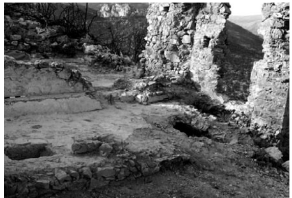
183. Leontari, Agia Kyriaki: medieval Byzantine church within the citadel.