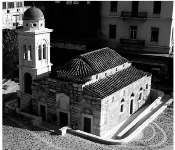
181. Athens, church of the Pantanassa after restoration.

Several recent reports concern the Middle or Late Byzantine churches of recognized or possible monasteries and cemeteries in the countryside (or erstwhile countryside). At Ktio, Diporo , in the upper Haliakmon valley, Prefecture of Grevena, the University of Thessaloniki continued excavating the Middle Byzantine phase of a multi-period cemetery. This phase is rich in grave goods such as fired pots, iron knives, iron arrow-heads, jewellery, dress ornaments and coins of the ninth century. This spectrum of grave goods (less the coins) is not uncommon from the end of the sixth century. Northeast of Daphne (southeast of Sparta) the 5 th EBA reports on the study of excavations conducted in 1996 at the monastic complex of St George on the hill of Lykovouno . The wider hill-top settlement both pre-dates and post-dates the monastic church, of whose first phase of decoration an 11 th –12 th -century opus sectile floor and a 12 th -century templon are preserved. A phase of recon-