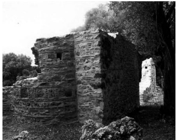
182. Photike, Valsamari: Middle Byzantine basilica.