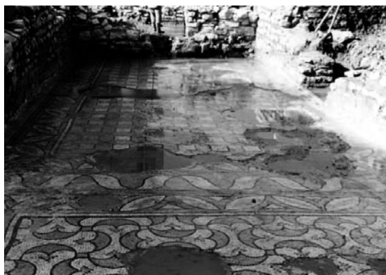
179. Ladochori: Early Byzantine élite residence.

The significance of the villa in Early Byzantine Greece (élite rural residence, bailiff-managed estate or both) is a challenge similar in importance to, and overlapping in substance with, the challenge of sites such as Opagia. Several recently-reported excavations concern sites which can be interpreted as centres of estates or units of estates. At Maroulas , Demos of Rethymnon, Crete, the 28 th EBA has excavated an agricultural villa with at least two phases (mid-third to sixth century). At Ladochori near Igoumenitsa within the Early Byzantine settlement the 8 th EBA has excavated a residential complex focused upon a long mosaic-paved central hall with annexes ( Fig. 179 ). This design and the discovery within it of architectural sculpture indicate an élite residence of some kind. The discovery of much domestic pottery and glass could strengthen the case for it being an élite residence. The discovery of a terracotta mould of the Good Shepherd raises the possibility of its association with the church. In Aitolokarnania on the north shore of the Gulf of Patras in the vicinity (implicitly) of ancient Makynia , the 36 th EPCA excavated parts of a probable Roman villa, including its baths. The complex underwent much adaptation in Early Byzantine times, including intrusion of