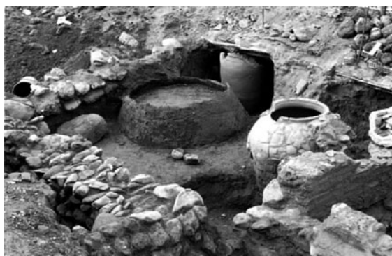
186. Athens, Pentelis Avenue: Late Byzantine to post-Byzantine agricultural storage complex.

Byzantine, not (as was thought by some scholars) Early Byzantine in origin. Middle Byzantine and Frankish phases have been distinguished in the excavations of the monastic cells. In the district of Paiania , Attica, the 1 st EBA recorded an extensive medieval Byzantine and post-Byzantine cemetery. At Agioi Theodoroi, Kiphissia , a probable funerary church in use from ca. AD 900 onwards, associated with re-used and superimposed graves, some of which contained jewellery and pottery, has been explored too. At Maroussi , Attica, part of a Late Byzantine chapel (probably single-aisled) surrounded by graves has been excavated.