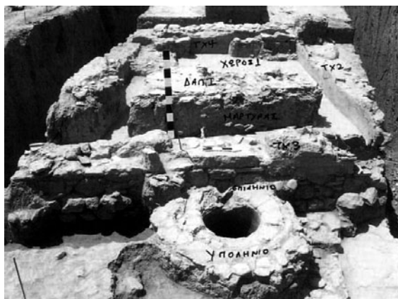
184. Agios Ioannis Rentis: Middle Byzantine winery.