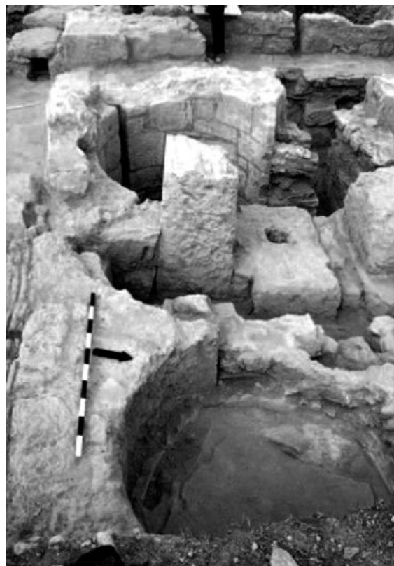
174. Corinth: caldarium of Early Byzantine bath-house.

Artisanal production in intramural contexts has been documented again in Thessaloniki , where in 2009–2010 an Early Byzantine glass workshop was found ( AR 57 [2010–2011] 28). In 2010–2011 significant traces of mercury in an Early Byzantine context are interpreted as evidence of gold refining.