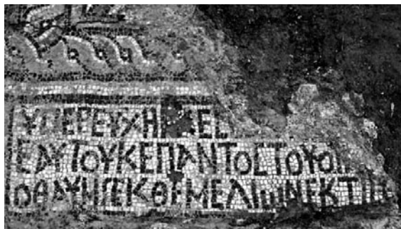
177. Livanates: religious donor's inscription in mosaic paving (Early Byzantine).

A clearly important example of the new fortified complexes that are such a feature of the Early Byzantine countryside is being excavated by the 8 th EBA at Opagia, Doliana , at the northeastern end of the Plain of Kalpaki. An octagonal tower has been identified (indicative of a high-status origin) ( Fig. 178 ) and two Early Byzantine churches. Excavation of Basilica A revealed a three-aisled church with transepts and a narthex and two phases of mosaic floors dated to the late fifth to mid-sixth century, containing scenes of hunting, marine life, personifications of rivers and animal combats. Élite patronage may be assumed. This complex invites comparison with contemporary foundations in the Balkans and elsewhere in northern Greece. It is not clear whether this is the mosaic-paved basilica at Kalpaki reported in Chronika in 1964 and 1968.