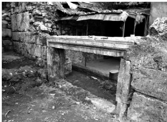
173. Athens: Early Byzantine fortifications (probable gateway).

sections of the spolia-built defences of Byzantine Demetrias . This Early to Middle Byzantine site is to be distinguished, however, from the site of ancient Demetrias (see ‘Thessaly’ section).