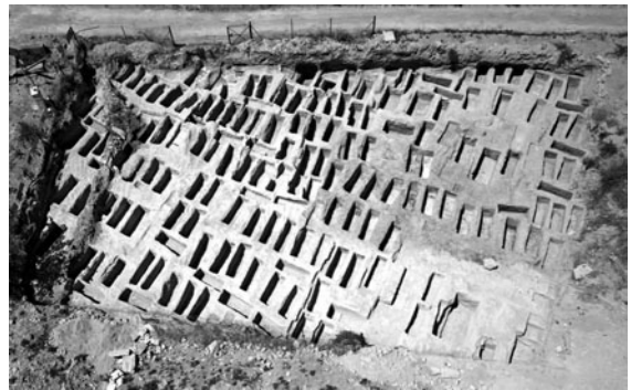
176. Corinth: Early Byzantine extramural cemetery.

If the urban archaeology of Early Byzantine towns and cities starts to correspond to recognizable themes and their variations, the archaeology of the Early Byzantine countryside has remained, at least until recently, a huge challenge, still largely resistant to synthesis between the approaches of different 'schools' of archaeology. The dominant approaches consist of the excavation of rural churches without specific contextualization; extensive survey of the 'monumental landscape' (essentially rural churches and fortifications); and the identification of 'ceramic landscapes' on the basis of evidence from multi-period intensive surveys. It could be argued that many of the recently-reported excavations of features of the Early Byzantine countryside of Greece, nearly all 'rescue'-led, are potentially beneficial developments for the integration and interpretation of the data generated by the three dominant approaches, including the often architecturally defined excavations and surveys of rural churches.