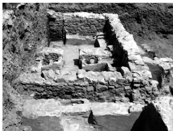
180. Nafpaktos: medieval Byzantine bath-house.