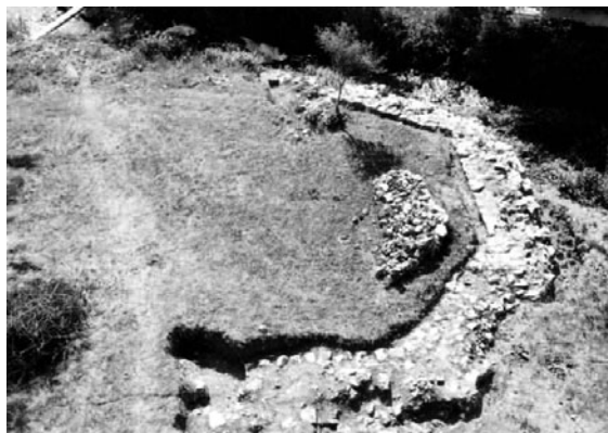
178. Doliana: aerial view of octagonal tower of Early Byzantine fortification.

A clearly important example of the new fortified complexes that are such a feature of the Early Byzantine countryside is being excavated by the 8 th EBA at Opagia, Doliana , at the northeastern end of the Plain of Kalpaki. An octagonal tower has been identified (indicative of a high-status origin) ( Fig. 178 ) and two Early Byzantine churches. Excavation of Basilica A revealed a three-aisled church with transepts and a narthex and two phases of mosaic floors dated to the late fifth to mid-sixth century, containing scenes of hunting, marine life, personifications of rivers and animal combats. Élite patronage may be assumed. This complex invites comparison with contemporary foundations in the Balkans and elsewhere in northern Greece. It is not clear whether this is the mosaic-paved basilica at Kalpaki reported in Chronika in 1964 and 1968.