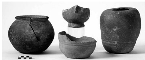
155. Athens, Agora: Middle Byzantine ceramics found during 2010 in Section BΘ.