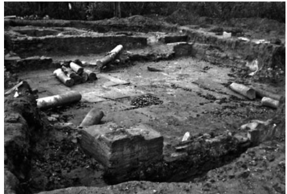
33. Ag. Menas, Velvendos: Proto-Byzantine bath complex northwest of the basilica.

Rarely explored, but of great significance for any understanding of the Late Roman settlement patterns of mainland Greece (arguably with the exception of the Peloponnese), are rural fortifications of various origins. The 7 th EBA explored in 2008–2009 the fortress of Velika , in the vicinity of ancient Meliboia, Thessaly ( Fig. 34 ). The site overlooks an important north-south route through eastern Thessaly and partly reconditions an ancient fortification. It is powerfully constructed in a lime-mortar bonded masonry. It contains a church (whose dimensions seem not yet established) and has yielded sixth- to seventh-century pottery. It thus has all the characteristics of a type of Late Roman site found throughout the Balkan peninsula. Interestingly, a similar complex at Kastri Livadiou , near Doliche in Thessaly, was previously reported by the 7 th EBA.