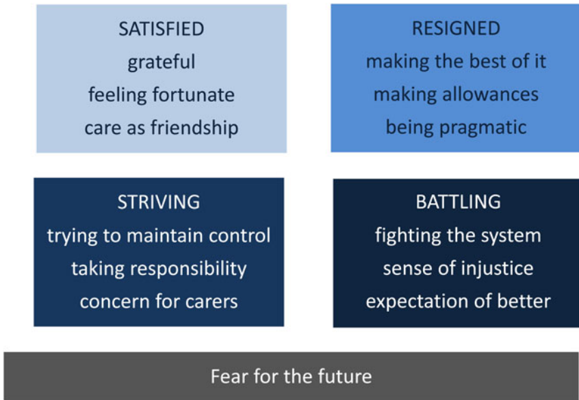
Figure 1. Narrative categories.