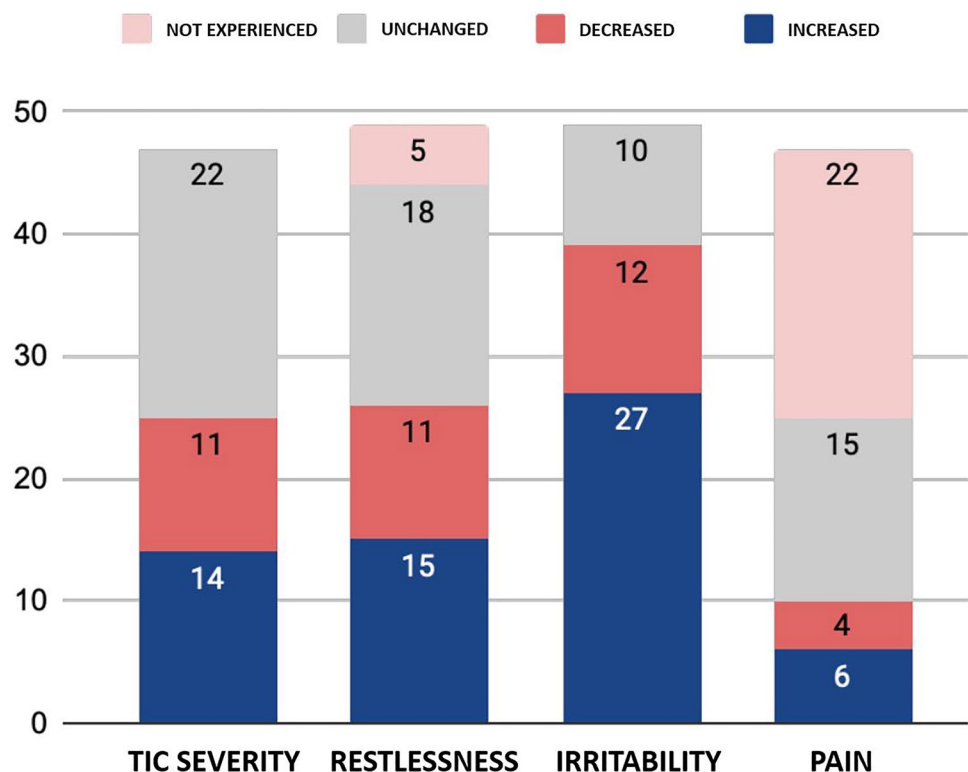
Fig. 1 Self-reported changes in tic severity and related clinical variables in young patients with tic disorders during lockdown

According to the regression analysis, the presence of tics was associated with increased difficulties with remote learning ( t = -2.58 ; p = 0.01 ), but decreased feelings of missing out on social interactions with schoolmates ( t = -2.19 ; p = 0.03 ). Having access to an outdoor space at home was found to be significantly associated with reduced stress/anxiety and preserved daily routines ( t = 3.89 , p < 0.01 ; and t = 2.55 , p = 0.01 , respectively). Participants with parents working as health professionals were more likely to report less stress/anxiety ( t = 3.19 ; p < 0.01 ), despite changes