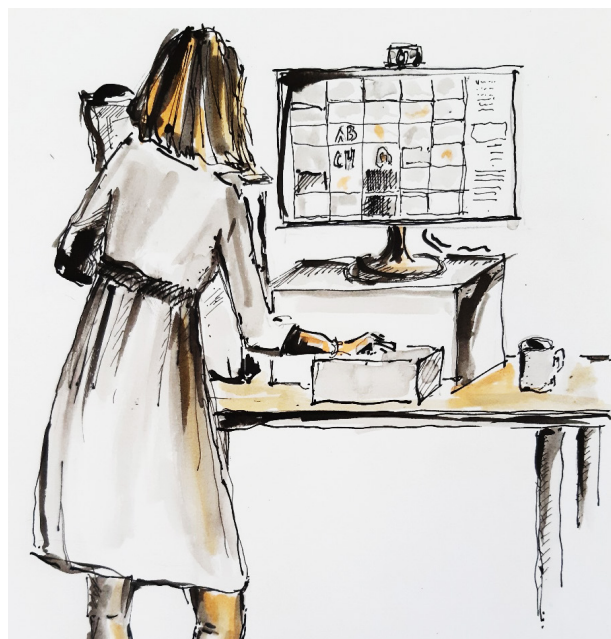
Figure 1 - "Lecturing to images from the kitchen table"

(Received 1 January 2022; revised version received 25 January 2022; final version accepted 21 March 2022)