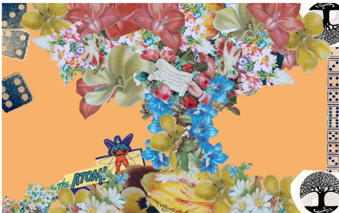
Fig. 2 The Spectacular Possibility of Living a Half Life , by ‘Helix’. © ‘Helix’ and Rona Cran

affective and informally creative nature of their responses to the collage composer and to the fragments themselves. Examples of feedback received from participants include (italics are mine):