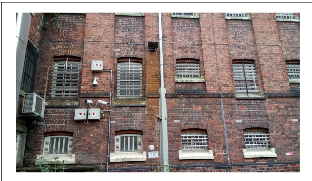
Figure 1. Exterior View of HMP Shrewsbury Showing Different Window Sizes, Security Cameras, and Pipework.

early Victorian designs (for an overview, see B. Bailey, 1987; V. Bailey, 1981, 2019; A. Brown, 2003; Davie, 2016; Evans, 1982; Ignatieff, 1989; Wiener, 1990).