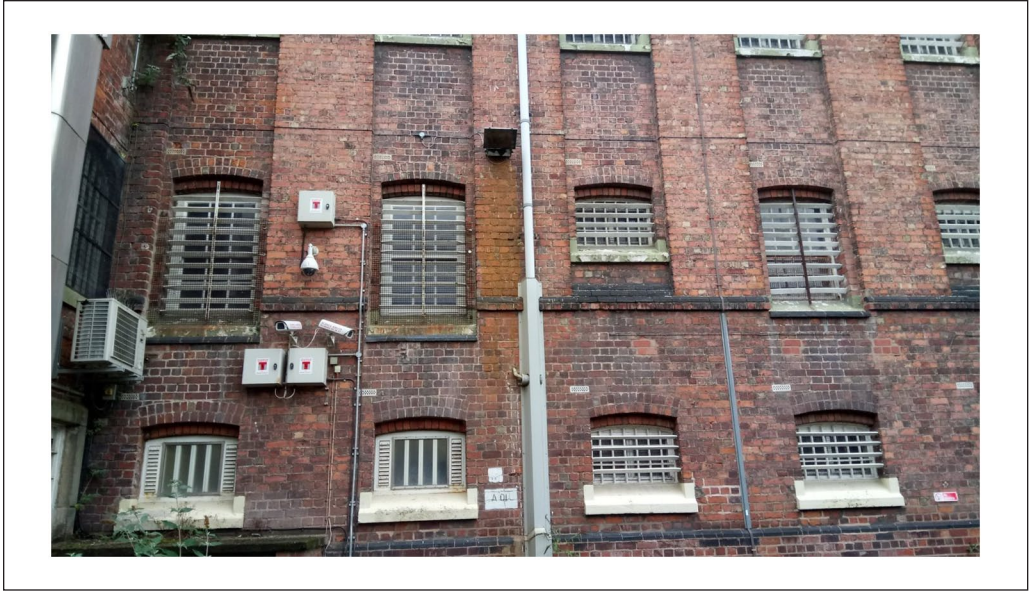
Figure 1. Exterior View of HMP Shrewsbury Showing Different Window Sizes, Security Cameras, and Pipework.

early Victorian designs (for an overview, see B. Bailey, 1987; V. Bailey, 1981, 2019; A. Brown, 2003; Davie, 2016; Evans, 1982; Ignatieff, 1989; Wiener, 1990).