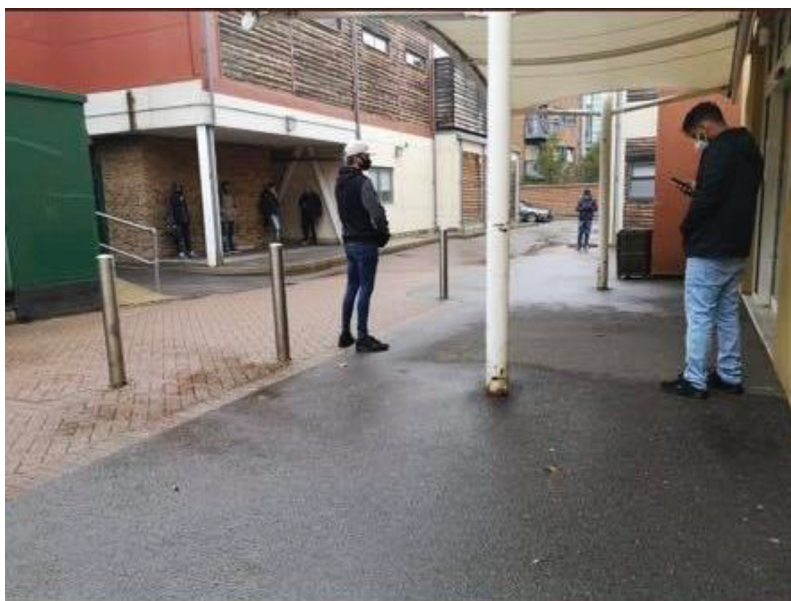
Figure 2. The New 'Waiting Room'.

removed from the labour/birth experience, instead waiting nearby. However, unlike in the 1960s, coronavirus-restrictions meant that expectant fathers were largely not permitted to enter even the hospital building, unless invited during the later stages of labour. Consequently, the pandemic saw the emergence of a new 'waiting room' for expectant fathers: outside, in the hospital car park (Figure 2).