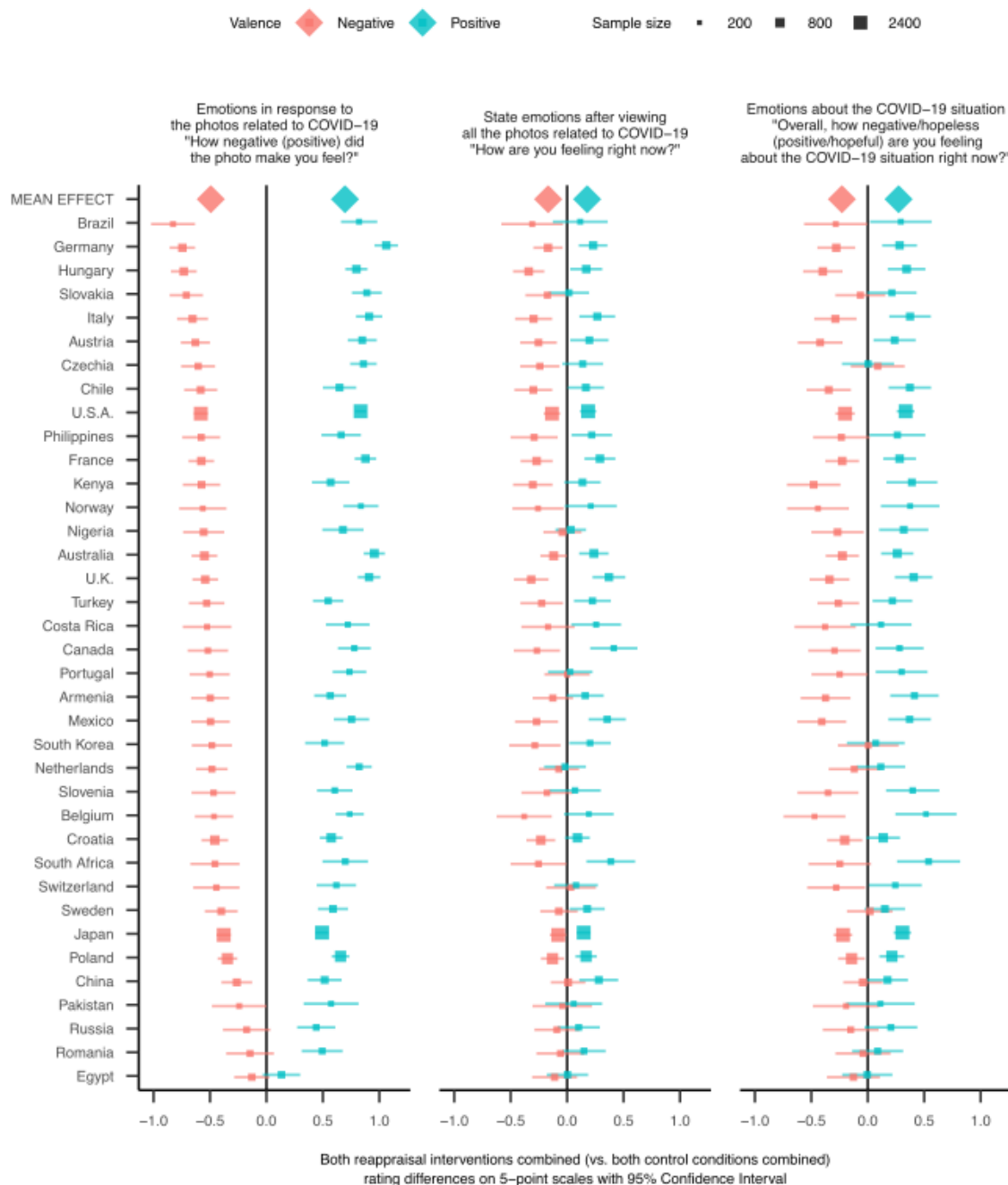
Fig. 1 | Effect sizes of both reappraisal interventions combined (vs. both control conditions combined) on primary outcomes by country/region. In almost all of the 37 countries/regions where we had over 200 participants, both reappraisal interventions combined (vs. both control conditions combined) decreased negative emotional responses and increased positive emotional responses for primary outcome measures (emotions in response to the photos, state emotions after viewing all the photos, and emotions about the COVID-19 situation). Effect sizes are raw mean differences on 5-point scales without adjusting for covariates. Confidence intervals are based on the t distribution. Countries/regions are ordered by decreasing effect sizes of negative emotions in response to the photos, and larger dots reflect larger samples. (Supplementary Fig. 1 presents the countries/regions in alphabetical order.)