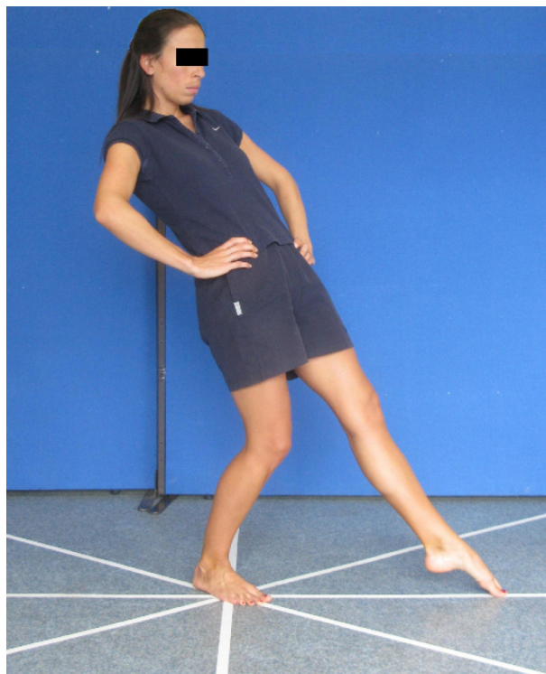
Figure 2 Participant performing anteromedial component of Star Excursion Balance Test on right leg, while leaning backwards and plantar flexing reaching foot. Right knee flexed to approximately 40°.

To be useful in clinical practice, the ART must demonstrate adequate measurement properties, including reliability, validity and responsiveness. 29 Reliability is often investigated first, being a prerequisite for the other properties. 30 In addition, it is recommended that initial studies of a new measure are conducted with healthy volunteers rather than patients, to exclude any variability