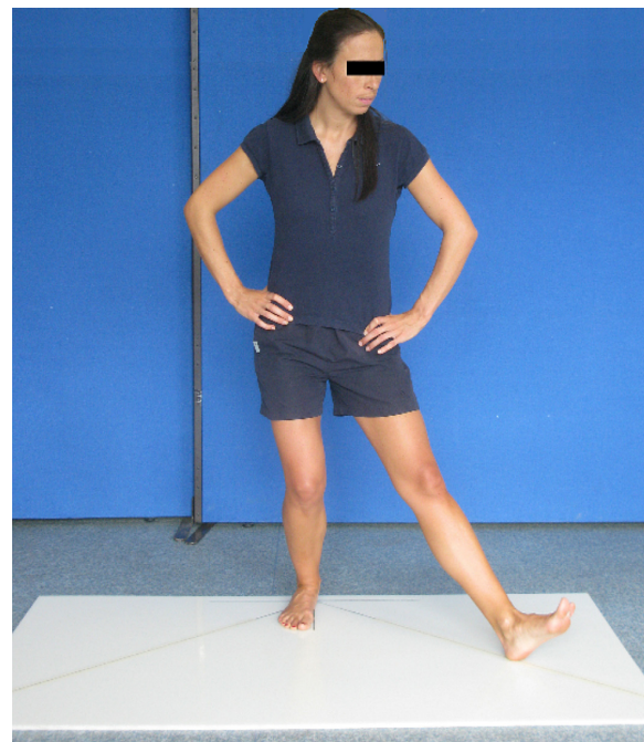
Figure 6 Anteromedial Reach Test performed on right leg.

Abbreviations: O, origin; RO, right oblique line; LO, left oblique line; T, transverse line; S, sagittal line; ART, Anteromedial Reach Test.