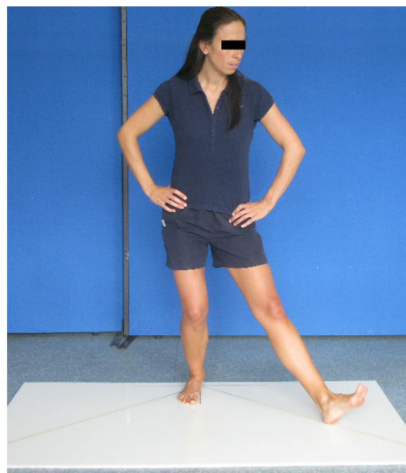
Figure 6 Anteromedial Reach Test performed on right leg.

Abbreviations: O, origin; RO, right oblique line; LO, left oblique line; T, transverse line; S, sagittal line; ART, Anteromedial Reach Test.