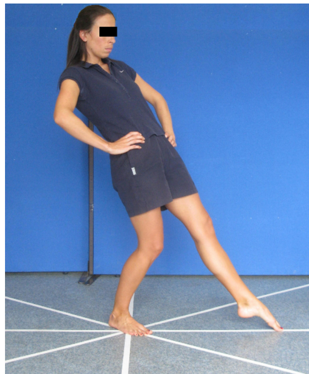
Figure 2 Participant performing anteromedial component of Star Excursion Balance Test on right leg, while leaning backwards and plantar flexing reaching foot. Right knee flexed to approximately 40°.

To be useful in clinical practice, the ART must demonstrate adequate measurement properties, including reliability, validity and responsiveness. 29 Reliability is often investigated first, being a prerequisite for the other properties. 30 In addition, it is recommended that initial studies of a new measure are conducted with healthy volunteers rather than patients, to exclude any variability