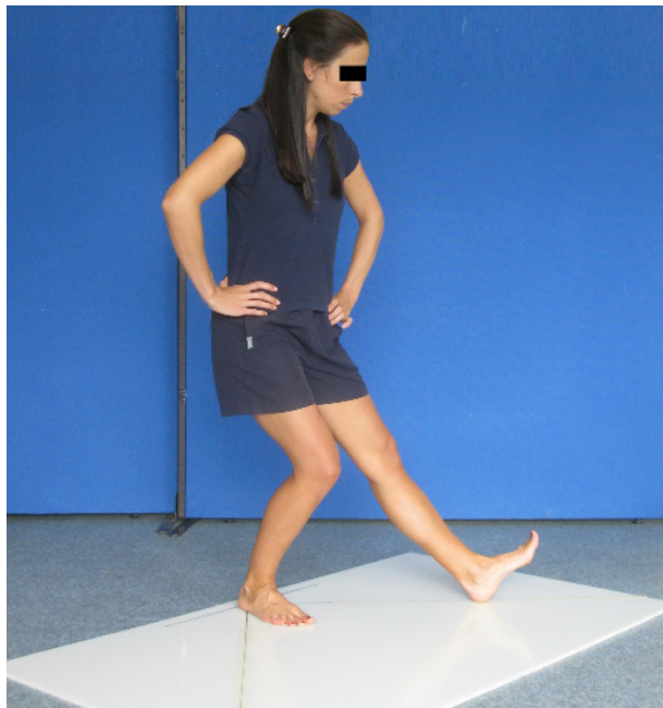
Figure 3 Participant performing Anteromedial Reach Test on right leg. Right knee flexed to approximately 60°.

due to fluctuation in symptoms. 31 For performance-based measures, where measurements are taken by a rater, both intrarater and interrater reliability are important. 32 Intrarater reliability is the extent to which measurements taken by the same rater are consistent, while interrater reliability is the extent to which measurements taken by different raters are similar. 29