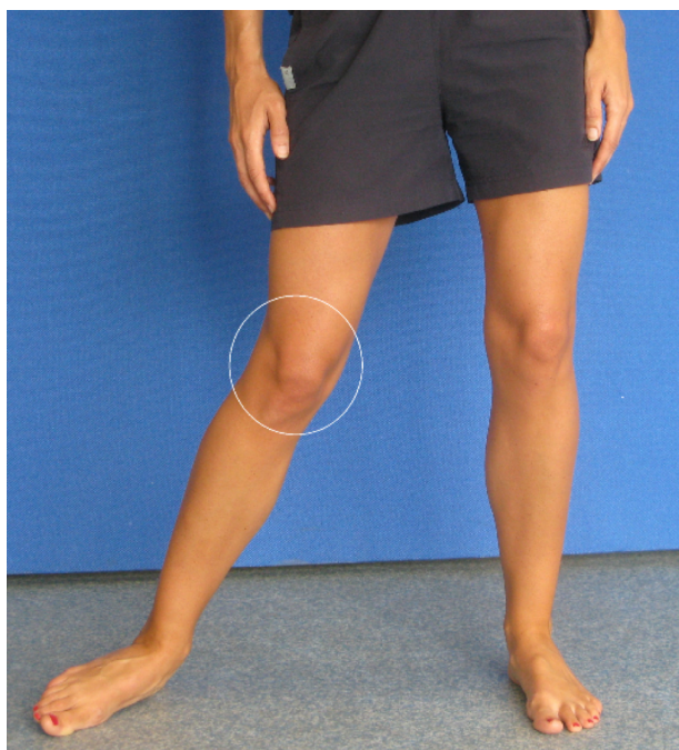
Figure 1 Dynamic lower extremity valgus.

the English National Health Service, 14 at an average cost of £1,500 per patient. 15