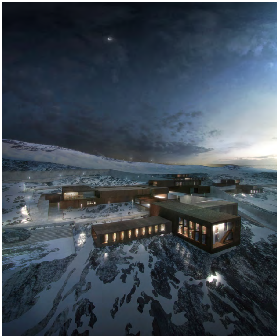
Correctional facility, Nuuk, Greenland. Schmidt Hammer Lassen Architects.

In this sense, Wrexham's perceived need for the generation of profit through punishment is following the lead of many small rural towns in the US, where policymakers are actively locating prisons in 'lagging' communities. It has been suggested that policymakers in states including California, have located 'inferior' public facilities in less affluent communities because there was less 'NIMBY' protest than in prosperous neighbourhoods and because, unable to attract private commerce, these areas are seemingly more willing to accept opportunities 'discarded' by others.