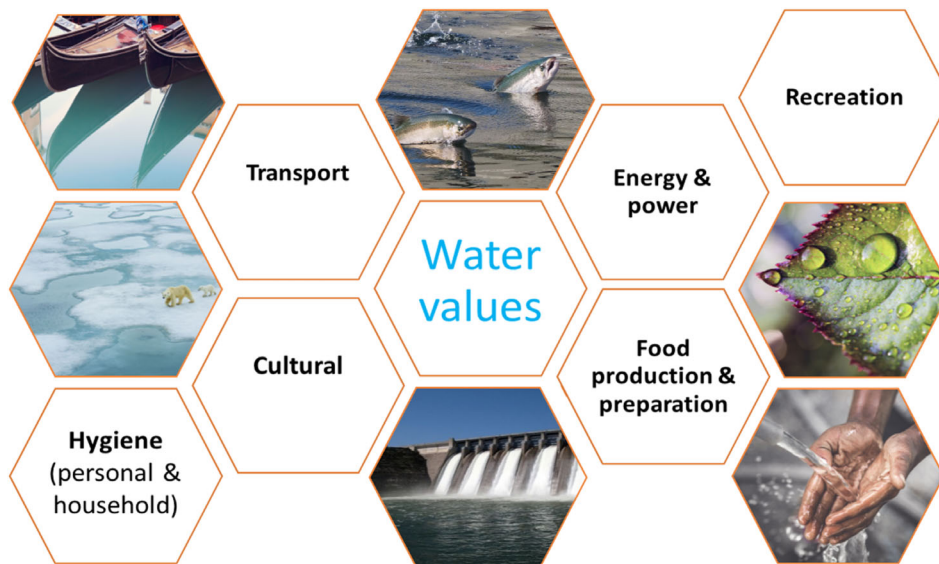
FIGURE 1 Diverse perspectives on how water is valued individually and collectively, summarizing the Water2me theme of World Water Day 2021

help improve its management and achieve global sustainable development’.