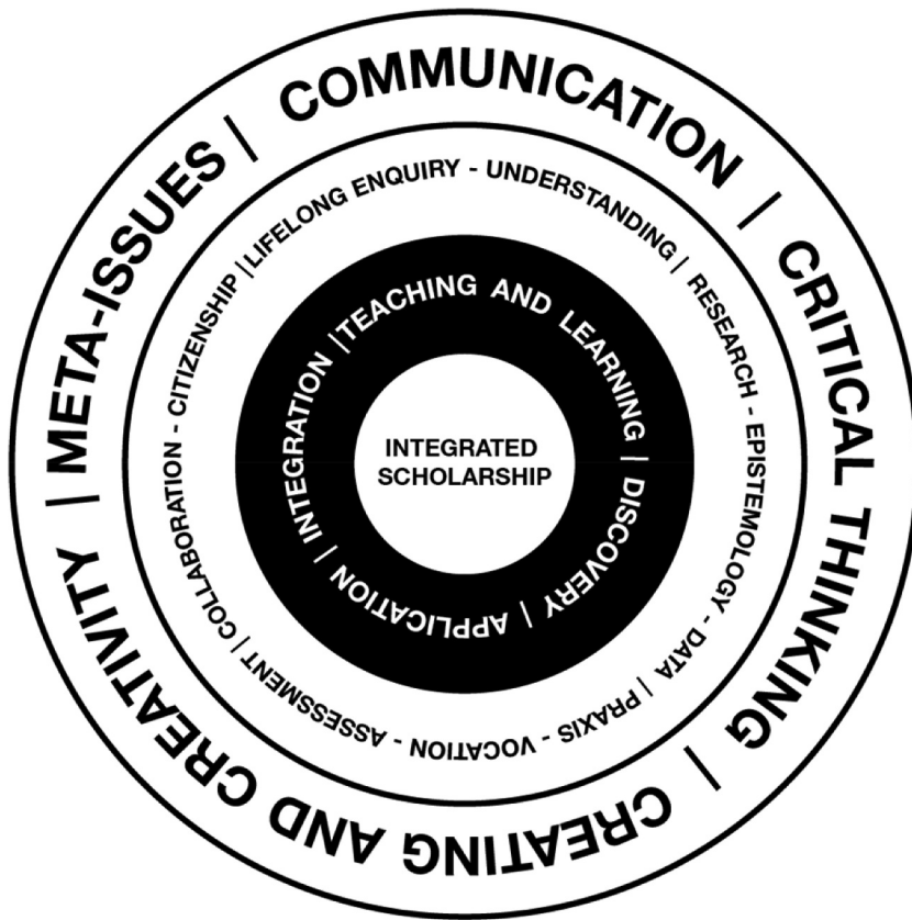
Figure 3. An integrated scholarship based on Boyer's scholarship reconsidered.

This philosophy rings true with work of Boyer and our speculative conceptualisations of the university of tomorrow. The famous Bauhaus pedagogy was depicted by founder of the School, Walter Gropius in 1922 in a circular diagram representing the interdisciplinary curriculum. DiSalvo (2019) explores new invigorated diagrams inspired by the original. These new versions include artificial intelligence, robotics, algorithms, data, sensors but also information and communication, culture, politics and ethics. Figure 3 takes inspiration from these works, along with Boyer to create a diagram for integrated scholarship for the university of tomorrow.