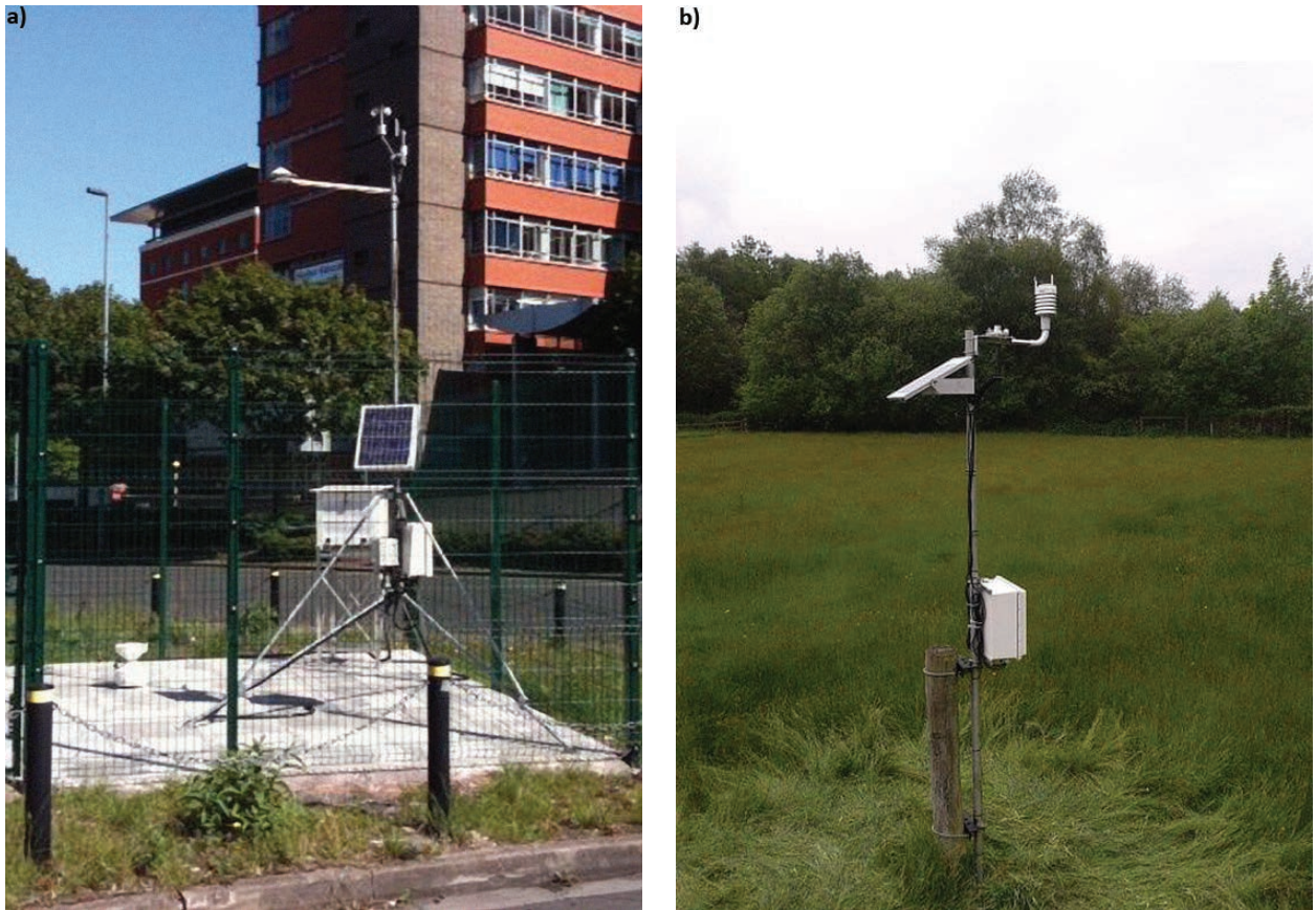
FIG. 1. Two very different meteorological stations in terms of siting (e.g., height of sensor, surface cover, distance from obstacles), instrumentation (e.g., type, performance characteristics), and exposure (representativeness would need to be assessed via micro- and local-scale surveys; see main text and supplementary material at http://dx.doi.org/10.1175/BAMS-D-12-00096.2 ). Both are located within the city boundaries of Birmingham, United Kingdom: (a) a city-center site and (b) an urban park site.