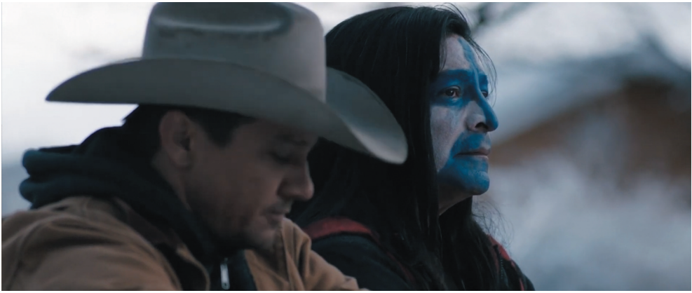
Figure 2. Instead of tribal identity, a made-up death face exhibits its erasure in Wind River (Sheridan 2017).

Native American women, that nobody knows how many are missing. The lost past of the Eastern Shoshone is erased and so unknowable; but how might audiences, filmmakers and scholars of World Cinema proceed past this ethical encounter with the lost past of this Native American tribe that is also our/their own?