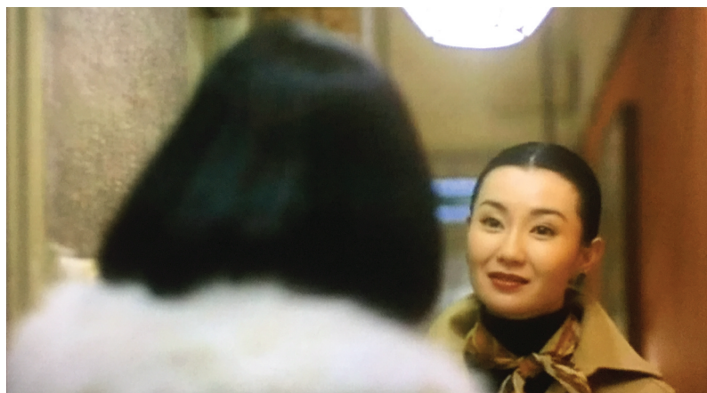
Figure 4. Mrs Chan meets Mr Chow's Singaporean wife in a deleted and printed scene on the Tartan DVD of Faa yeung nin wa / In The Mood For Love (Wong 2000).

In one 11-minute 'deleted/printed' scene entitled 'Chapter 3: The Seventies', Mrs Chan is shown to have foregone the high-collared Chinese cheongsams , close-fitting dresses that define her restricted movement while 'signalling the progression and repetition of time, specifically the time loops that characterise mourning as well as nostalgic recollection' throughout Faa yeung nin wa (Berghahn 2019, 43). Rather, she now wears casual western clothes of blouse and skirt that point to her imminent emigration (see Figure 4). Mr Chow, meanwhile, is represented by his young wife, a singer from Singapore (another British colony and trade rival) who considers renting and changing the apartment Mrs