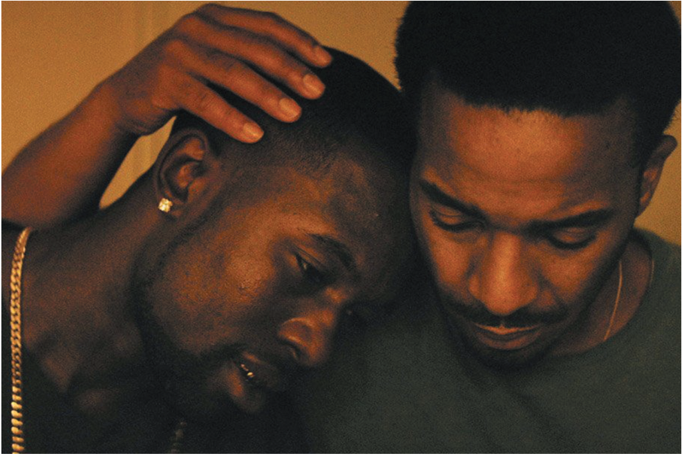
Figure 5. Différance signals the approach of a new paradigm in Moonlight (Jenkins 2016b).

structuralist chain of signification that expresses ‘the relationship to a past, to an always-already-there that no reactivation of the origin could fully master and awaken to presence’ (Derrida 1976, 64). Trace elements are like signs sought within the universe of activity before and beyond it by scientists responding to static from the Big Bang, which is an always-already-there that can hardly be conceptualised and prior to which nothing can be imagined. Shohat and Stam, and Altman too, suppose that Hollywood is the Big Bang of World Cinema and that traces of it abound, but the truth is that the ongoing Big Bang of World Cinema encloses Hollywood (the West). Derrida hints at the complexity of these relations within the sign as being between the signifier and the signified, seeing them not as subsequent nor as clear-cut as in the original Saussurean model, but rather broken by the different times – present and past – in which the elements of the sign coexist: ‘Since past has always signified present-past, the absolute past that is retained in the trace no longer rigorously merits the name “past”’ (Derrida 1976, 64). This leads Madan Sarup to conclude that ‘ the sign marks an absent presence . Rather than present the object, we employ the sign; however, the meaning of the sign is always postponed or deferred’ (1993, 44). In this he follows Derrida, who deletes and retains the deleted sign, arguing that: