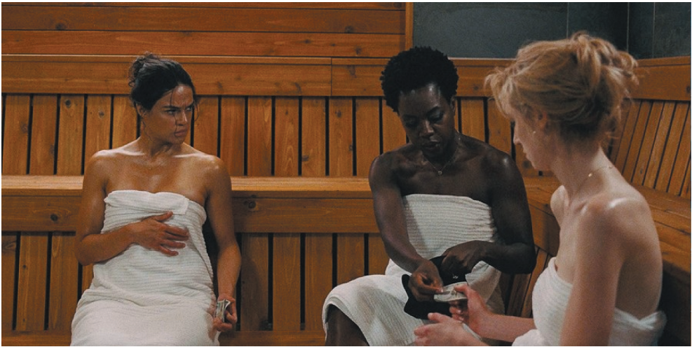
Figure 1. Exposure makes differences explicit and erasure makes them irrelevant in Widows (McQueen 2018).

that extend the debate over erasure and appropriation established in Unthinking Eurocentrism: Multiculturalism and the Media , wherein Shohat and Stam argued that ‘the residual traces of centuries of axiomatic European domination inform the general culture, the everyday language, and the media, engendering a fictitious sense of the innate superiority of European-derived cultures and peoples’ (1994, 1). Aiming to demote Hollywood to one of many cinemas of the world, their use of the concept of ‘trace’ echoed Derrida and was key to their argument, which diagnosed a cultural hierarchy in which European culture, including ‘the neo-Europeans’ of North America and Australia, ‘bifurcates the world into the “West and the Rest”’ (Shohat and Stam 1994, 1). This hierarchy is articulated around a strategy that ‘organizes everyday language into binaristic hierarchies implicitly flattering to Europe: our “nations”, their “tribes”; our “religions”, their “superstitions”; our “culture”, their “folklore”; our “art”, their “artefacts”; our “demonstrations”, their “riots”; our “defense”, their “terrorism”’ (Shohat and Stam 1994, 2). So what is ‘ours’ and what is ‘theirs’ in this image from Widows ?