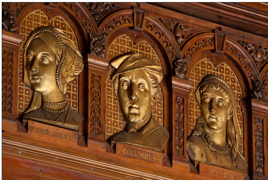
Fig. 2: Nathaniel Hitch, Relief portraits for Lord Astor at Two Temple Place, c. 1894–96. Two Temple Place, London.