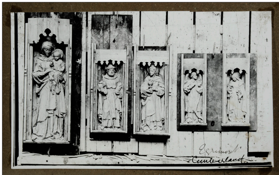
Fig. 4: Nathaniel Hitch, Photograph of a clay and wood model for the reredos for the church of St Mary & St Michael's in Egremont, Cumbria. 1999.1 Photograph album of the sculpture of Nathaniel Hitch and others, c. 1890–1930, Henry Moore Institute.