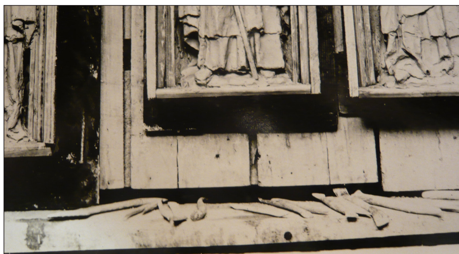
Fig. 5: Nathaniel Hitch, Photograph of a clay and wood model for the reredos for the church of St Mary & St Michael's in Egremont, Cumbria (detail). Note the modelling tools on the shelf. 1999.1 Photograph album of the sculpture of Nathaniel Hitch and others, c. 1890–1930, Henry Moore Institute.

working on all five works simultaneously. The tools indicate that Hitch worked the clay block in situ , almost like direct carving, creating a sculpture from within its architecturally defined space.