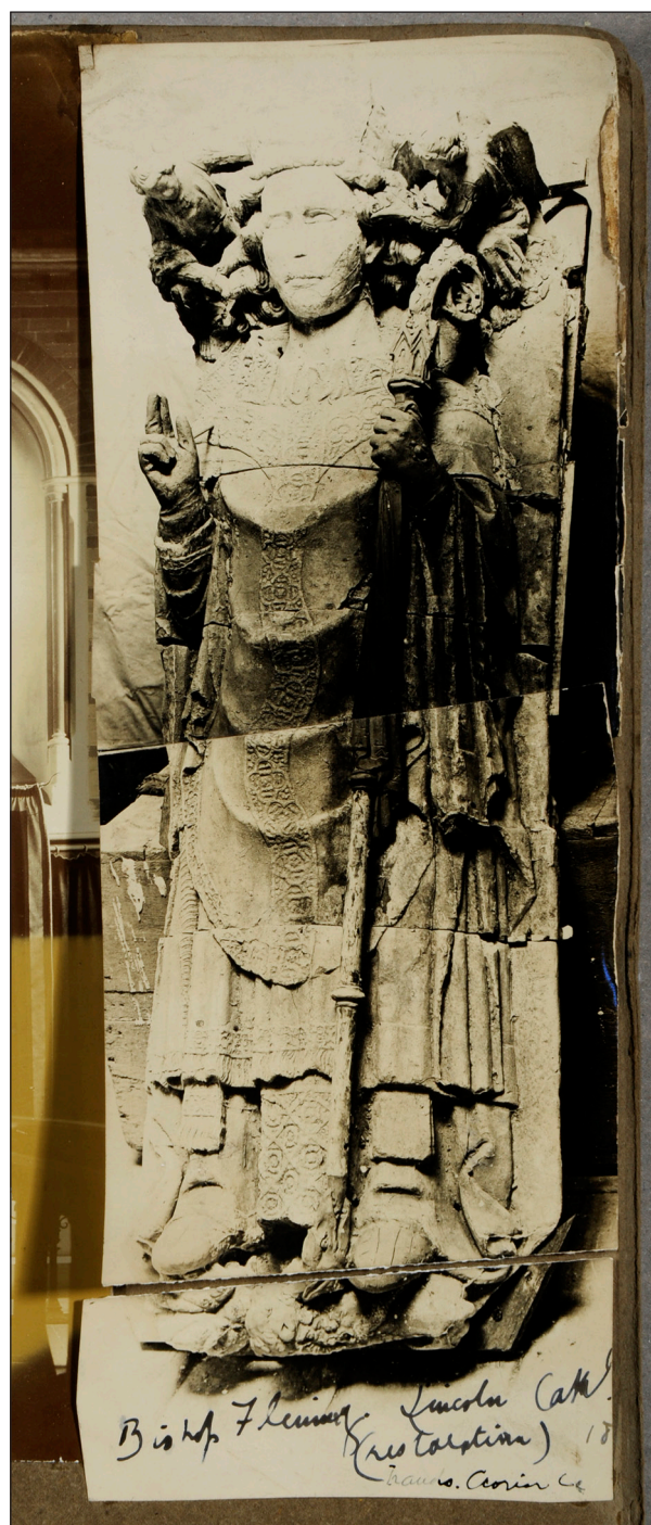
Fig. 3: Nathaniel Hitch, Photograph annotated 'Bishop Fleming, Lincoln Cathedral (restoration) hands. Crozier'. 1999.1 Photograph album of the sculpture of Nathaniel Hitch and others, c. 1890–1930, Henry Moore Institute.