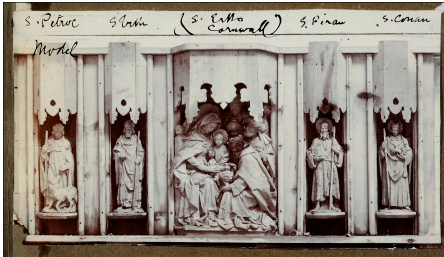
Fig. 6: Nathaniel Hitch, Photograph of a clay and wood model for a reredos for St Erth's parish church in Cornwall. 1999.1 Photograph album of the sculpture of Nathaniel Hitch and others, c. 1890–1930, Henry Moore Institute.

plaster cast. Damp cloths would have kept the clay sufficiently moist during works, particularly if they were operating in adjacent workshops. The relationship between the clay model and the final work can be seen in the following two photographs (Figs. 6, 7). The first documents Hitch's clay model for a reredos for St Erth's parish church in Cornwall; the second, the