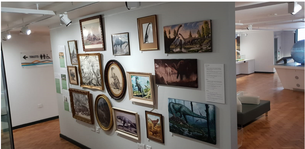
Fig 4. Photo of ‘Drawing out the Dinosaurs’ Exhibition

a little incongruous. Rock is called a dinosaur at points in the text, but it is also clear that he remains an animated statue, not a flesh-and-blood creature, and the fact that he barely resembles the Ancestors he so admires is, in many ways, the point of the book. The answer to this incongruity, of course, is that it is both/and not either/or. It is precisely because of the mutability of the dinosaur as a social object—its ability to inhabit two apparently contradictory states simultaneously—that Rock can be both an innocent student of the Mesozoic past and an instructive product of it. This mutability is also exercised by the statues themselves in real life; it is granted, in part, by the textual constitution of the museum object. Revising labels (doing away with old ones when new information is discovered) is essential for the pedagogical aims of the museum, but can also be seen as yet another strategy to obscure the instability of truth in the museum, and to hide the speculative nature of much of the knowledge displayed. While we suggested that restorations are ‘dangerous’ because they reveal the speculation which was always inherent in the museum display, they are also valuable because they cannot be so easily rewritten or swept under the rug. Indeed, there are often laws in place specifically to prevent this (the Crystal Palace models are categorized as Grade I listed buildings in order to ensure their protection).