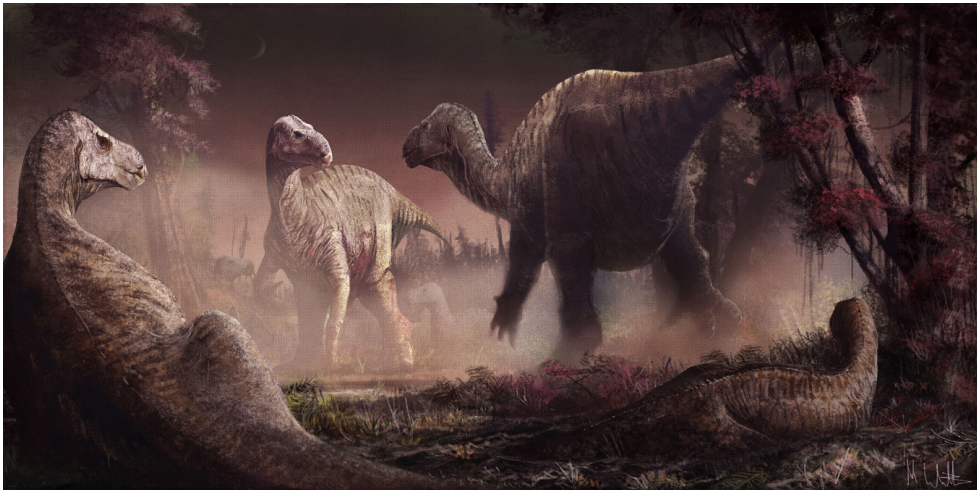
Fig 2. Contemporary depiction of Iguanodon

This short speech is revealing as regards Rock’s ontological situation: he is certainly a model—lacking ‘flesh and blood’ even when magically brought to life—and yet the relationship envisaged with the genuine living creatures of the Mesozoic is one of descent, not of imitation. As Daniel tells Rock more about the history of the Crystal Palace dinosaurs, the text portrays the slippery relationship between object and signified: at one point, Rock learns about the dinner party famously held inside him on New Year’s Eve 1853 (‘How dare they hold a dinner party inside me when they’d made me all wrong’, 33), at another he tries an apple in order to learn about the diet of the actual living creatures among which he implicitly counts himself (‘Your Ancestors ate vegetable things, and plants and leaves, not meat’, 28). When Rock asks ‘And how did we get our name, do you know, by any chance?’, the plural could refer both to the presence of the second Crystal Palace Iguanodon —silent in the text, beside Rock on the ground in real life—or to the fact that two kinds of different things, one mortar and one bone, have both been given the name Iguanodon (25). Rock’s question can mean both ‘how did we statues come to be named after such dissimilar, living animals?’ and ‘how did the group of living animals, of which I am a member, come to be named?’.