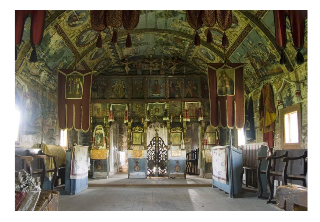
Figure 2 Freont Nicoara - The wooden pentecost church of Fildu de Sus, Sălaj County (1727). Interior view.

Wooden architecture had become a topic of interest in the final decade of the nineteenth century across much of Europe. Art historians and artists in localities as diverse as Norway, Bohemia, Poland and Russia had 'discovered' it as the authentic expression of regional artistic traditions that deviated from the traditions of the traditional artistic centres of Germany, Italy and France. As such it was one of the central elements of the folk art revival of central Europe, in which architects and designers such as Dušan Jurkovič (1868-1947), Stanisław Witkiewicz (1851-1915) and Károly Kós (1883-1977) drew on traditional forms of wooden vernacular architecture in order to effect a national cultural and spiritual renewal. For Petranu there was an additional, local, significance to the subject, for a central part of his argument was that the Romanian vernacular art and culture of Transylvania had been systematically marginalised. As Petranu commented, 'If he took publications by the Hungarian and Saxon minorities at their word, the foreigner would be under the false impression that it was only the Transylvanian Hungarians and Saxons who had any art.'12