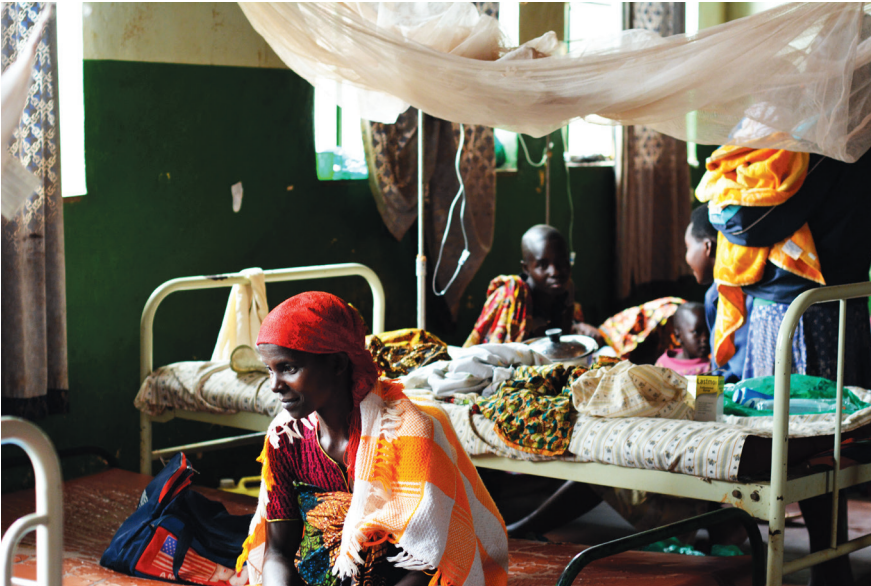
Photo: The authors acknowledge www.pixabay.com artist elisemertens89 .

equality in the ability to address either issue will again have impacts on HD. Data filtration could alleviate the size issue but would cause undesirable information loss. To retain as much relevant data as possible, special-purpose computer clusters can be built to withstand the required load. This often leads to centralization of data into a single location [10], improving safety but impeding accessibility and potentially affordability. Inversely, distributed infrastructure, combining compute and storage, is being explored to keep the data close to its source, thus minimizing the transport of data, maximizing its proximity to expert analysts and safeguarding its access. Furthermore, this can allow for a more flexible and affordable infrastructure that is better