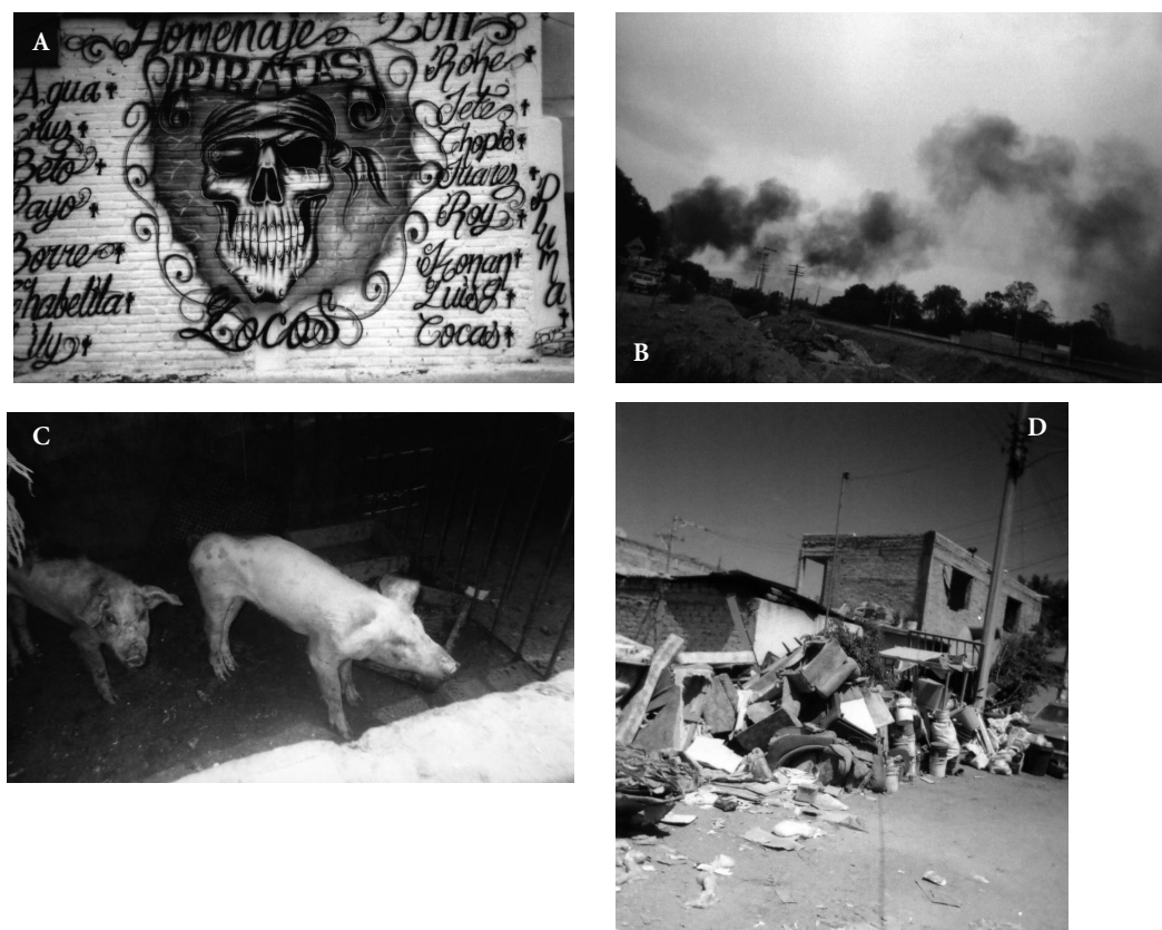
Figure 3. Examples of photographs of risks perceived by the students outside their homes (A) Vandalism in Morales (B) Air pollution due to the operation of brick-kilns in “Las Terceras” (C) Pigs kept by families in “Las Terceras” (D) Waste in the streets of “Las Terceras”.

rance among the residents. One student argued that people should get punished for throwing their waste on the street. Others indicated that people should make a basic contribution by saving water, polluting less and recycling. However, even though most of the respondents expressed that they would like to live in a clean environment, only very few mentioned how this could be achieved. In this sense, a local risk communication program could not only provide information on environmental health risks in the communities, but it could also provide alternatives while actively engaging the population in the process.